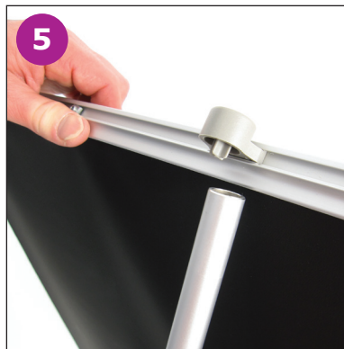
5 Secure the top cap of the graphic rail to the top of the pole