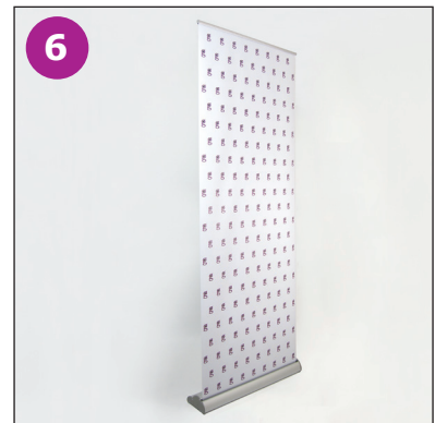
6 Finished piece