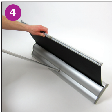
4 Carefully tip the pole side of the stand towards you and gently pull graphic rail upwards