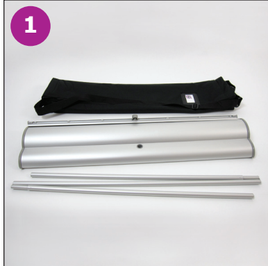
1 Remove all pieces from the transport bag

gawck retractable plus™ | gawck retractable plus, extra-wide™