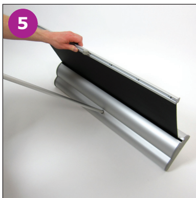
5 Carefully tip the pole side of the stand towards you and gently pull graphic rail upwards