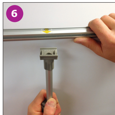
6 Insert end of pole into graphic rail as marked