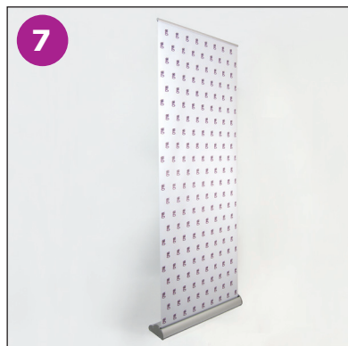
7 Finished piece