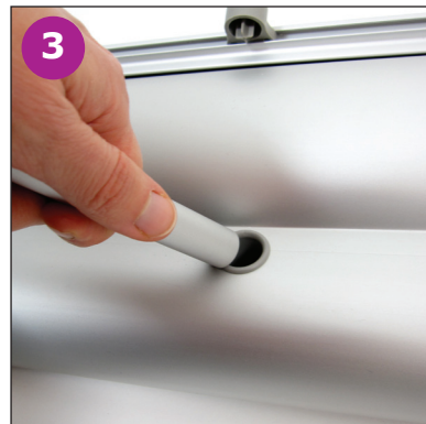
3 Insert the end of the pole into the base