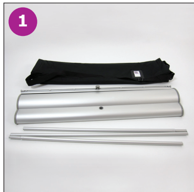
1 Remove all pieces from the transport bag