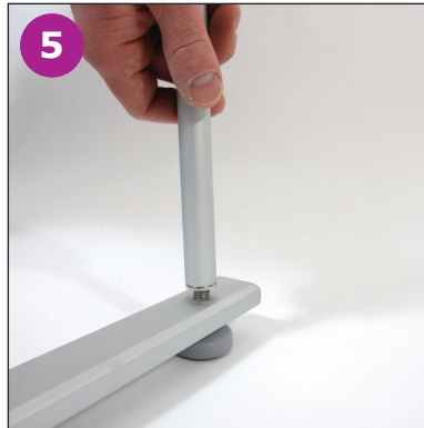
5 Thread pole onto base