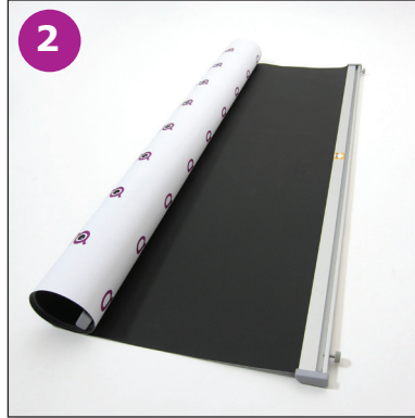
2 Lay graphic down with bottom rail exposed