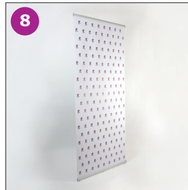
8 Finished piece

NOTE: When disassembling, roll graphic from the top, with black side facing out. Place graphic into inner cardboard sleeve and support arm into outer tube.