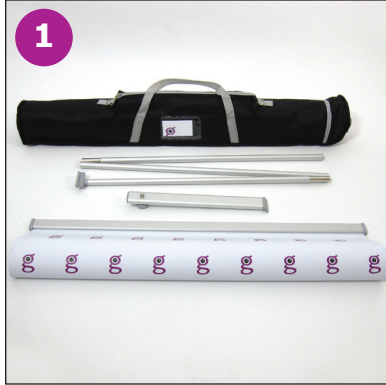
1 Remove all pieces from the transport bag