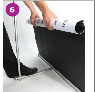
6 Place your foot on the base, your arms on either side of the pole and unroll graphic