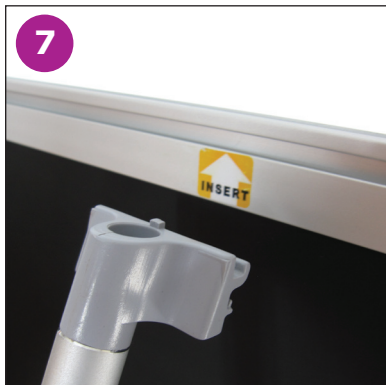
7 Flex pole forward and insert end into top rail groove